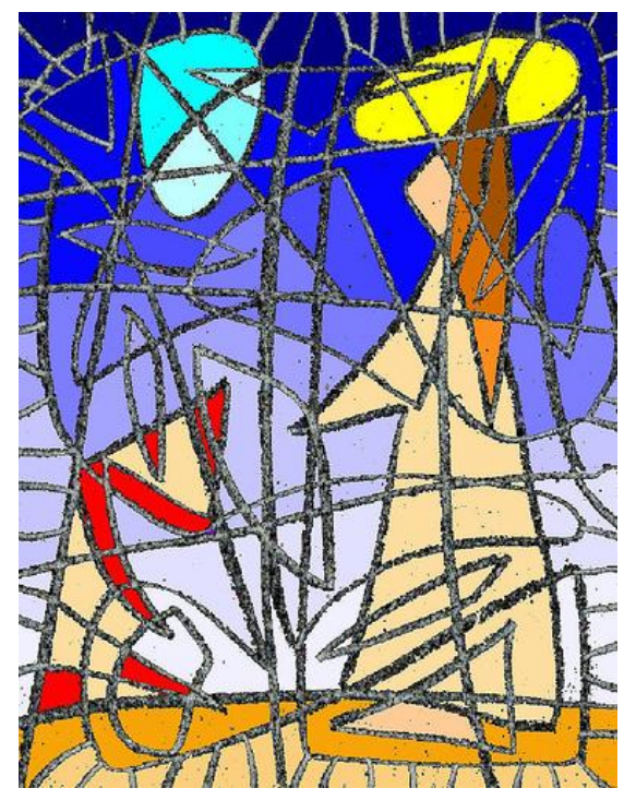
Healing the Gerasene http://glenkirk.blogspot.co.uk/